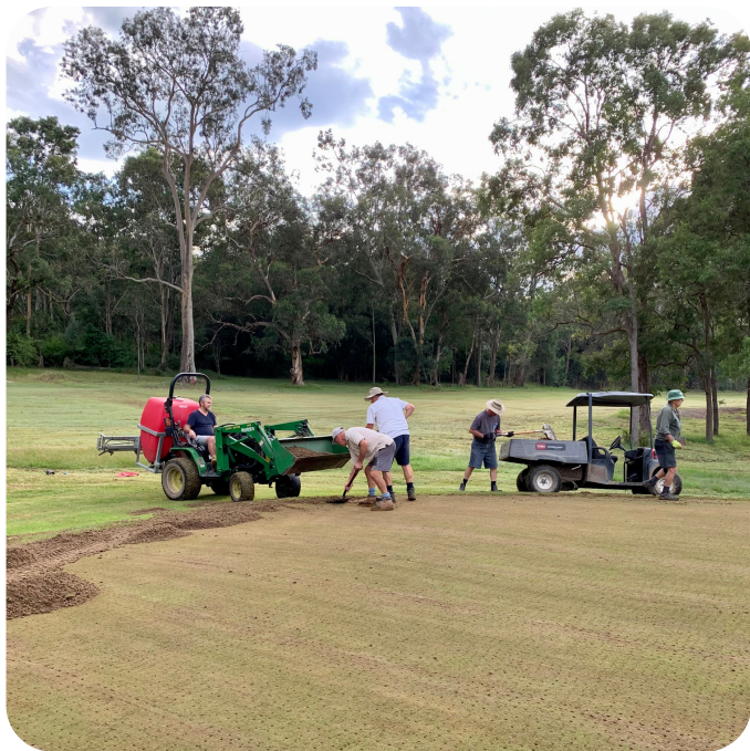
Pictured | Our volunteers hard at work during the recent renovations.