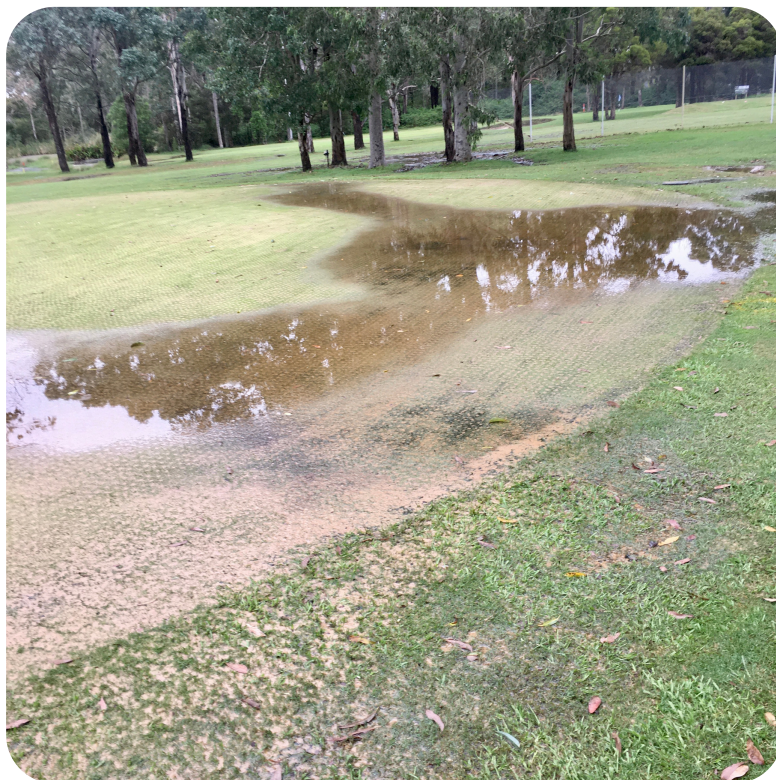
Pictured | Water pooling across the 8th green